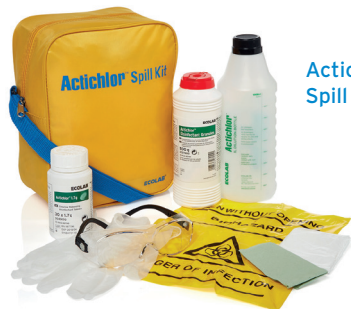
Actichlor Spill Kit