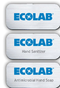
Product Category Badges

TO LEARN MORE CALL 800.392.3392 OR VISIT ECOLAB.COM