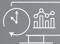
REAL-TIME DATA VIEWS

Service Intelligence, powered by ECOLAB3D, enhances collaboration and transparency with your Nalco Water support team. Consistent service delivery that serves your business priorities has never been easier with: