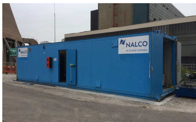
Fig.2 - Fully containerized PURATE Generator installed on customer site