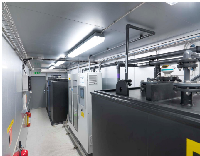
Fig.3 - Inside view of PURATE container showing control panel and chemical storage tanks